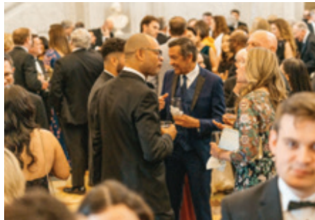
Guests enjoy the reception.