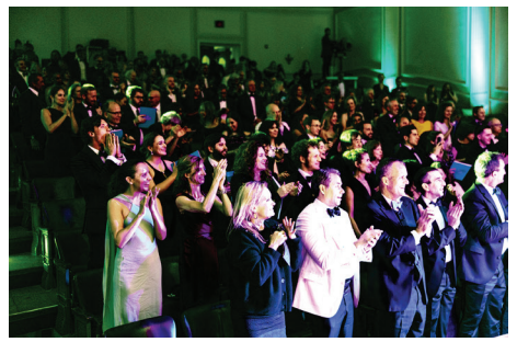
Guests enjoy Idina Menzel's performance.