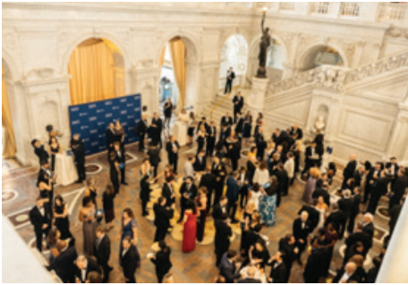
Cocktail Reception in the Great Hall begins