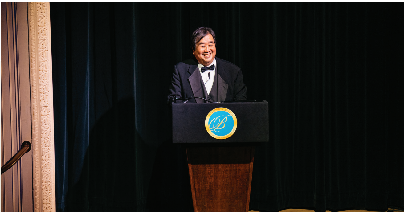
Dean Harold Hongju Koh, Sterling Professor of International Law at Yale Law School, accepts the award as the finest academic in law.

The Hon. Robert A. Katzmann Award for Academic Excellence, recognizing the finest academician in law, was given to Harold Hongju Koh, Sterling Professor of International Law at Yale Law School. The award, inspired by the life and work of the Honorable Robert A. Katzmann, is presented annually to a law school dean or professor who has brought added prominence and recognition to their academic institution; if a dean, has demonstrated the finest leadership in overseeing and directing staff operations; if a professor, has demonstrated the highest scholarship and dedication to students; has displayed the utmost aplomb and fine character; and has earned the highest respect and admiration of other leaders in the field of legal education. The award is named after the esteemed Hon. Robert A. Katzmann who served from 1999 to 2021 on the U.S. Court of Appeals for the Second Circuit and from 2013 to 2020 was Chief Judge.