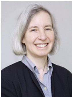
Above: Martha Minow, former Dean of Harvard Law School and current 300th Anniversary University Professor at Harvard University.