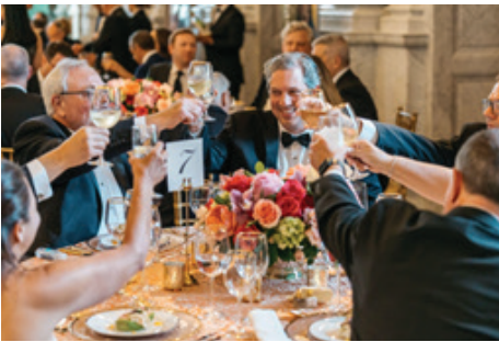
Toast to the winners.