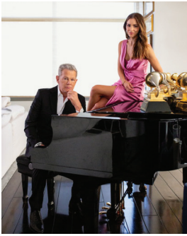
David Foster and Katharine McPhee.

David Foster is one of the most illustrious composers of our time. With 16 Grammy Awards, including three for Producer of the Year, an Emmy Award, a Golden Globe, and Three Oscar nominations for “Best Original Song,” Foster has earned a reputation as a keen spotter of new talent, playing a key role in the discovery and career launches of Celine Dion, Josh Groban, and Michael Bublé.