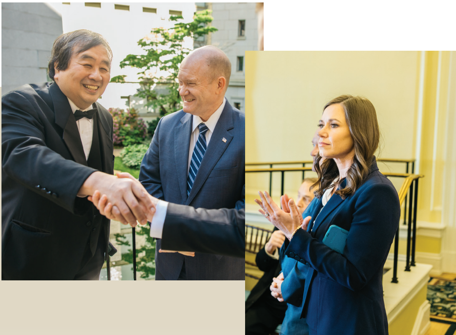
Left: Harold Hongju Koh, Sterling Professor of International Law at Yale Law School and 2024 winner of the Robert A. Katzmann Award for Academic Excellence, and U.S. Senator Chris Coons (Delaware), an alumni of Yale Law School, celebrate at the 2024 Burton Awards. Right: U.S. Senator Katie Britt (Alabama) attended the program.

The prominent guests at the twenty-fifth Anniversary program included six U.S. Senators. We were honored to have welcomed Senator Chris Coons, Senator Katie Britt, Senator Mike Rounds, Senator Jim Risch, Senator Dan Sullivan, and Senator John Barrasso.