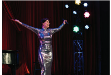
Idina Menzel performs at the twenty-fifth Anniversary Event.