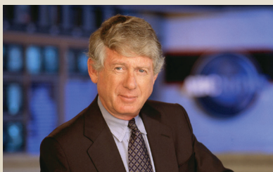
Ted Koppel, 2025 Master of Ceremonies.

Ted Koppel, noted journalist and former anchor of ABC's "Nightline," will be the Master of Ceremonies at the twenty-sixth Annual Burton Awards. With a career spanning over more than five decades, Ted Koppel is one of the most respected and influential figures in broadcast journalism.