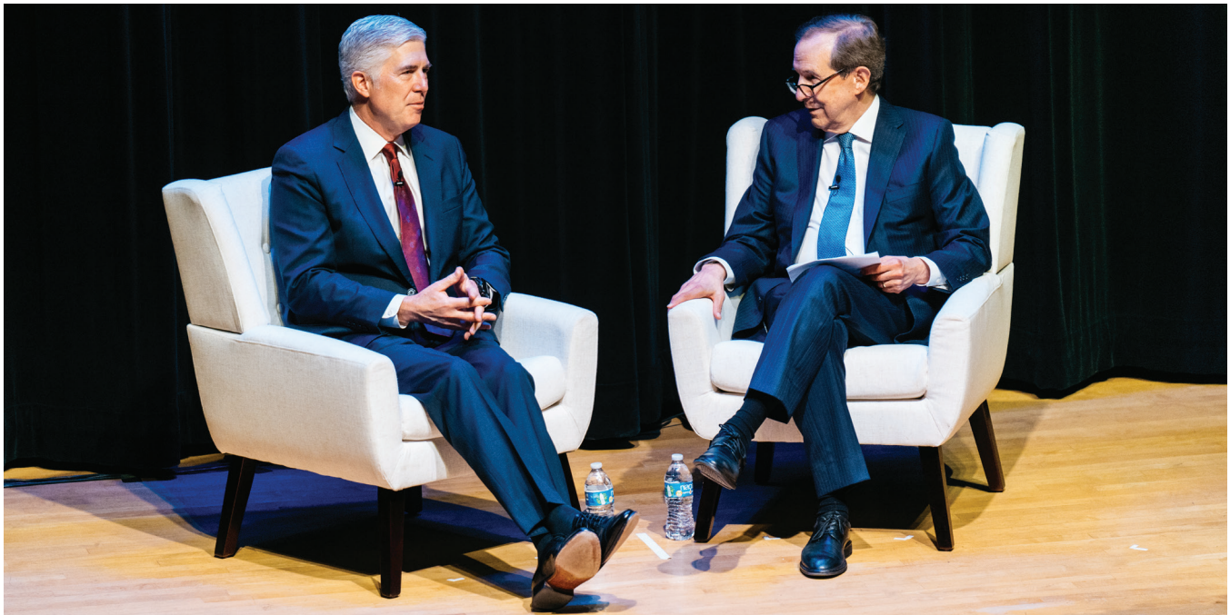
U.S. Supreme Court Justice Neil Gorsuch is interviewed by Chris Wallace at Twenty-Fifth Anniversary Awards Program.

A highlight of the twenty-fifth awards program was an informative conversation between U.S. Supreme Court Justice Neil Gorsuch and Journalist Chris Wallace. The discussion focused on U.S. Supreme Court Justice Gorsuch’s book, “A Republic, If You Can Keep It.” The interview delved into the importance of civic education, and the role of judges in maintaining the rule of law. His candid reflections on interpreting the constitution through a strict construction were illuminating.