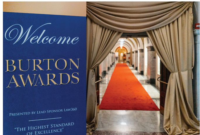
Inviting entryway to the start of the Burton Awards program.

At the beginning of the twenty-sixth Annual Burton Awards program, we are adding a cocktail reception before the program begins so everyone will have an opportunity to meet one another. This new addition will begin at 3:00 pm and will be held outside of the Coolidge Auditorium of the Library of Congress.