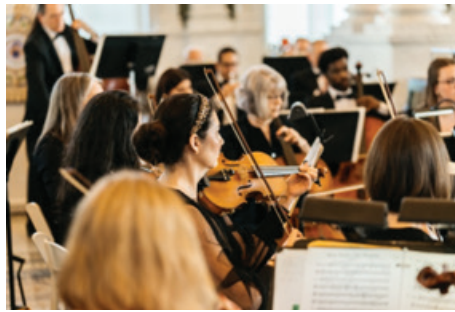
The orchestra delights guests.